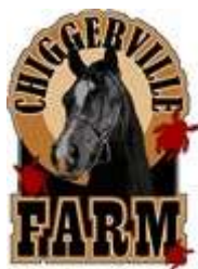
Your source for Witez II bloodlines