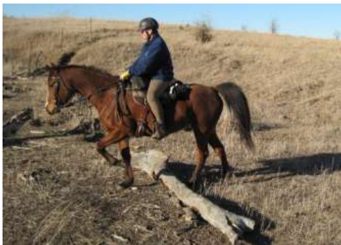
Xoala, "Zoey" ~

9-yr-old Arab mare, bay with some white, 14.2, sound and in good condition; needs more "finish" training to do ctr obstacles (such as side-pass), but otherwise a good trail/endurance mount. Loves to go, loves to trot, and does not care if leading, following or in the middle. Smooth gaits; goes in snaffle, curb or hackamore. Loads well in trailer and lunges; good for farrier. Asking $1800.