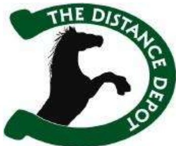
The Distance Depot Top quality Beta Biothane horse tack