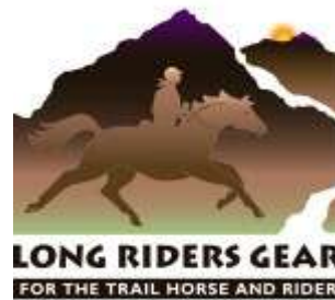
for the trail horse and rider