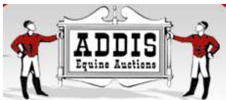
The leading Live Auction Company servicing the Arabian Horse Community in North America since 1987