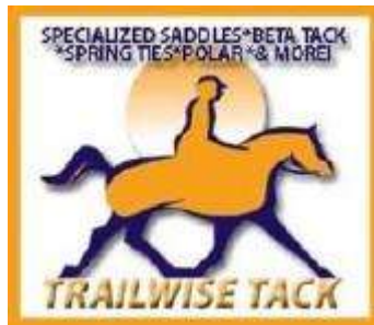
Essential gear for your long distance riding needs