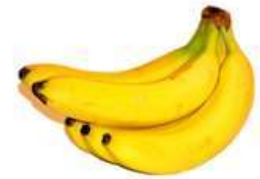
Bananas over carrots and apples, hmmm!