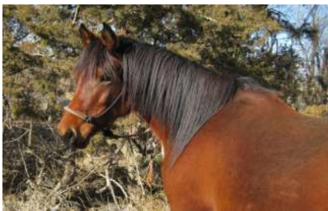
PS Arickaree Bask, "Rio" ~

9-yr-old Arab mare, bay with some white, 14.2, sound and in good condition; needs more "finish" training to do ctr obstacles (such as side-pass), but otherwise a good trail/endurance mount. Loves to go, loves to trot, and does not care if leading, following or in the middle. Smooth gaits; goes in snaffle, curb or hackamore. Loads well in trailer and lunges; good for farrier. Asking $1800.