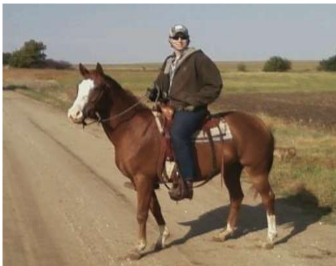
Miss American Pie, "Missy" ~

7-yr-old, 3/4 Arab mare, solid bay, 14.3, sound, very smooth gaits, well trained in snaffle or hackamore. Has been ridden in Black Hills; can handle rugged trails with ease. Rio is ready to start her competitive career. Sire and dam are multi-champions. Rio has unlimited potential in CTR or endurance. Lunges, loads, and is good for farrier. Asking $3500.